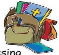
Blessing of the Backpacks