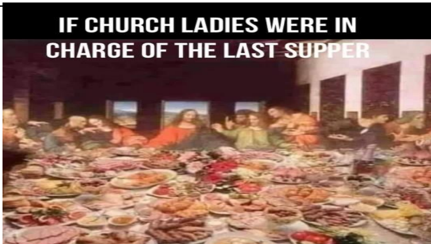
IF CHURCH LADIES WERE IN CHARGE OF THE LAST SUPPER