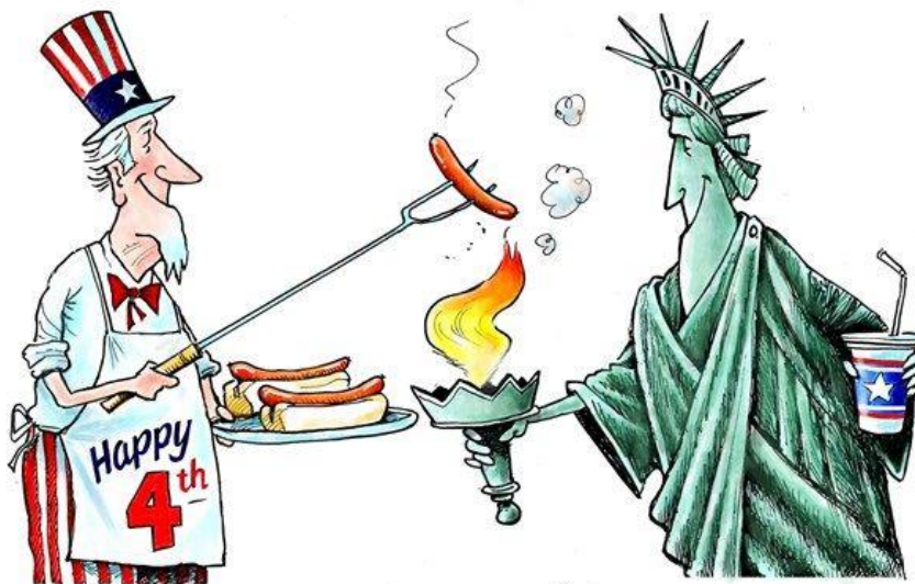
DAVE GRANLUND © www.davegranlund.com