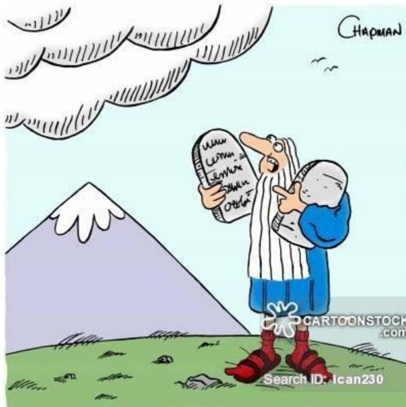
"But there's not enough space for Thou shalt not wear socks with sandals."